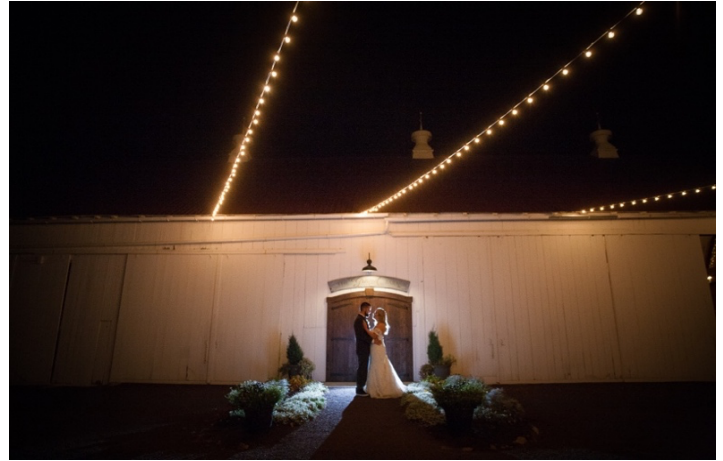
GRAND BARN – SEATS UP TO 175 PEOPLE FOR A RECEPTION

With rafters reaching 35 feet high and over 3600 square feet of floor space, the Grand Barn at Stoltzfus Homestead and Gardens is the perfect melding of rustic elements and elegant accents. Hand hewn boards, intricate loft ladders and notched lathe holders speak of a time when hard work, determination and an innovative spirit was the driving force behind the homesteaders who worked this land and harvested crops during the 1800's. Preserving the integrity of the workmanship in the Grand Barn was, thankfully, a non-negotiable as the current Stoltzfus generation began opening the property to couples wanting to speak their vows and celebrate with family and friends.